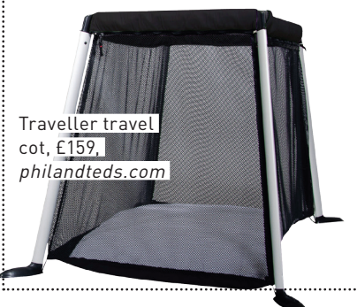
Traveller travel cot, £159, philandteds.com