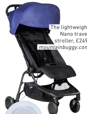
The lightweight Nano travel stroller, £249, mountainbuggy.com