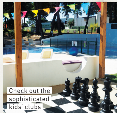
Check out the sophisticated kids' clubs

A seven-night all-inclusive stay starts from £719 per adult, excluding flights; there's a 45-minute transfer time from Faro airport; clubmed.co.uk