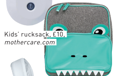
Kids' rucksack, £10, mothercare.com