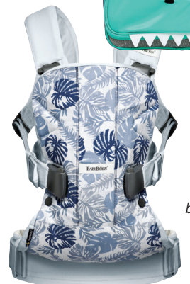
Baby Carrier One, £134.99, babybjorn.co.uk