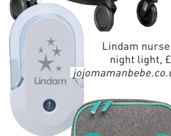
Lindam nursery night light, £8, jojomamanbebe.co.uk