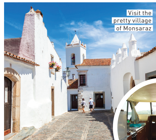
Visit the pretty village of Monsaraz

Amieira Marina's fleet of boats sleeps from two to 12; boating licences are not required; from £1,120 per week; the transfer time from Faro or Lisbon airports is two hours; amieiramarina.com