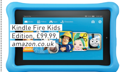
Kindle Fire Kids Edition, £99.99, amazon.co.uk