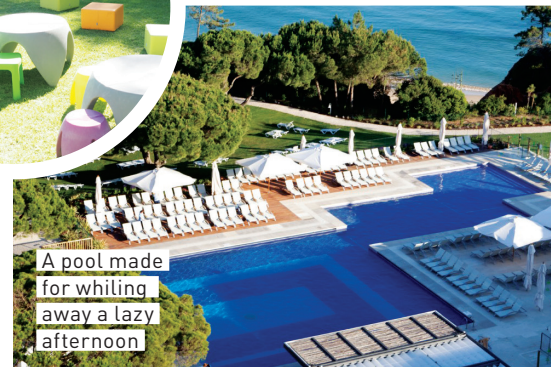
A pool made for whiling away a lazy afternoon