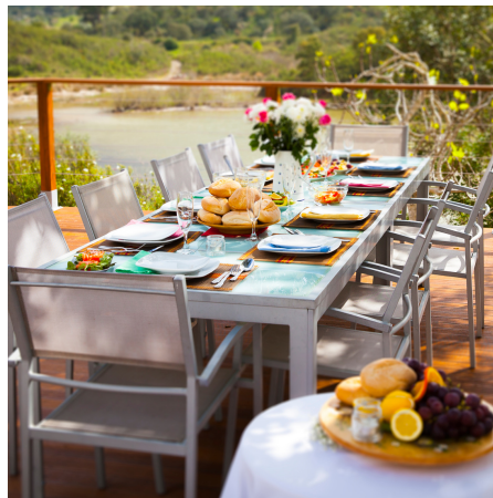
Al fresco dining to enjoy the incredibly delicious food