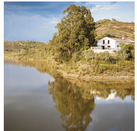
Direct waterside access for wild swimming or kayaking