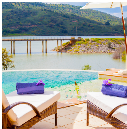
Infinity pool with peaceful water views